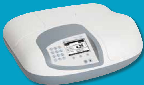
Ultraspec 2100 Pro

For labs seeking a balance between essential support and cost, we also offer Silver and Bronze Maintenance Contracts. Customers with Silver contracts receive one preventative maintenance and one breakdown visit. Bronze customers receives one preventative maintenance visit only.