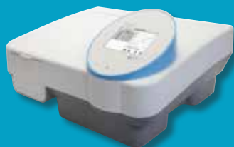
Ultrospec 7000 / 8000 / 9000

IQ/OQ documentation does not include the engineer's time. A minimum of 2 days will be charged. IQ/OQ can only be performed by qualified service engineers and not by the end user.