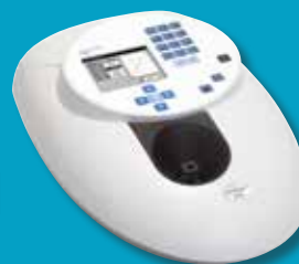
GeneQuant 100 / 1300