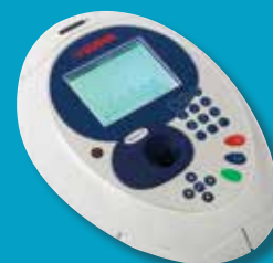
WPA Biowave / Lightwave