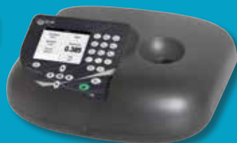
Libra S4+ / S6+