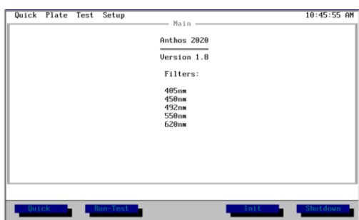
Figure 1. Anthos 2020 Display and Main Menu

To select options in the menu bar in the upper left corner, select menu and then the arrow keys to move the cursor to your selection. Select enter to access the option. Select stop to go back. The options at the bottom of the screen can be accessed using the function key below the desired option.